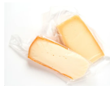
BAGS MAP, CVP, LONG-HOLD, SHORT-HOLD