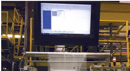
Electronic defect scanning.